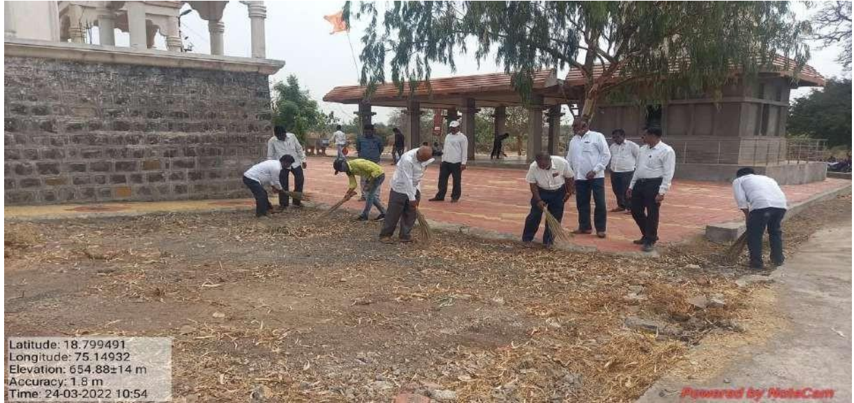
College students cleaning the temple premises of Lord Shankara in Dhanwade Vasti Ashti.