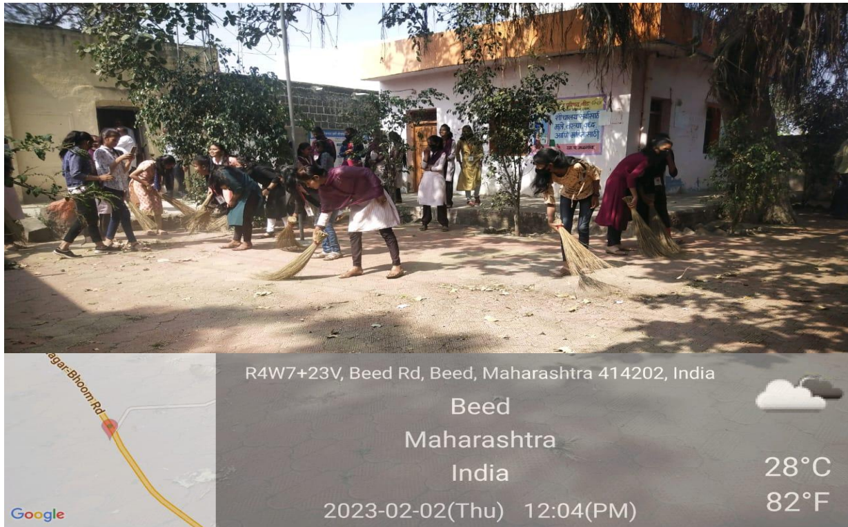
Students and teachers of the college during village cleaning in Shree Maruti Mandir area of Jalgaon.