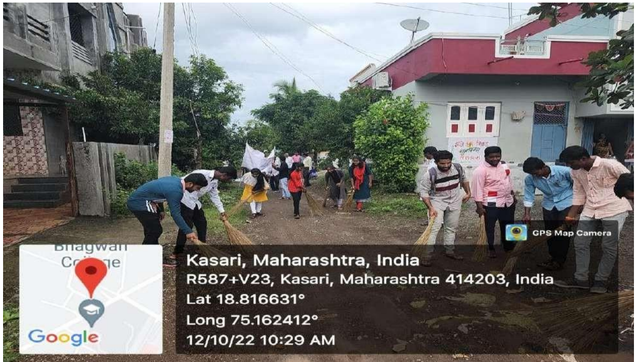
College students doing village cleaning at Murshadpur Ashti.