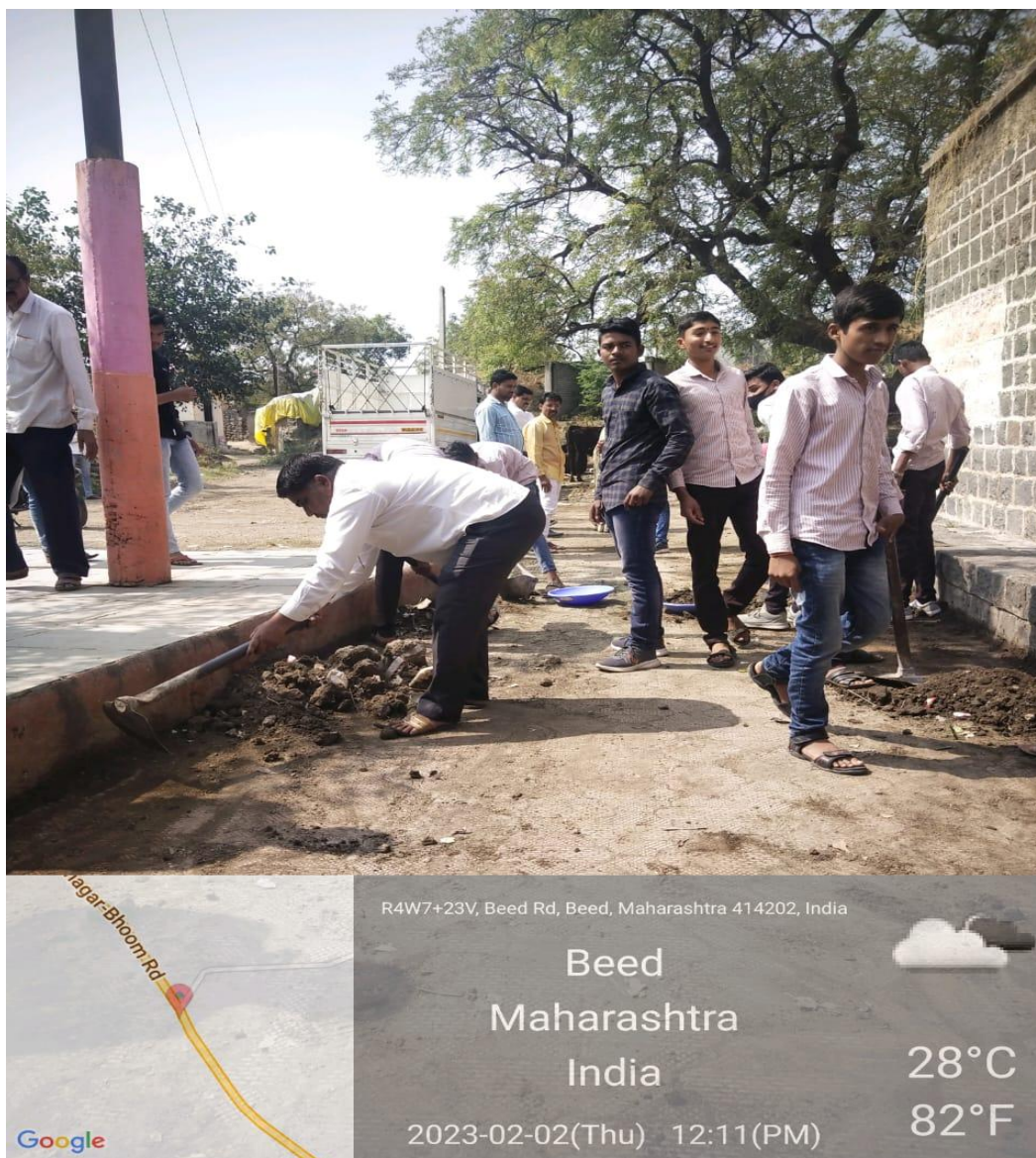
Students and teachers of the college during village cleaning in Shree Maruti Mandir area of Jalgaon.

Sinees Coordinator IQAC Bhagwan Mahavidyalaya, Ashti, Tal. Ashti, Dist. Beed