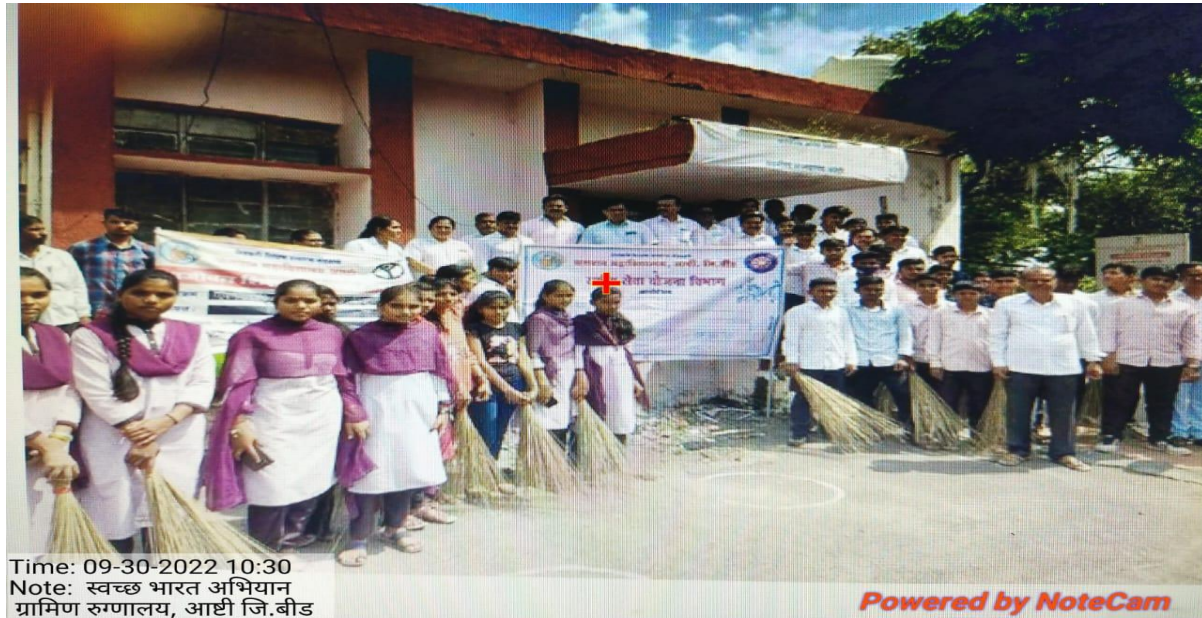
College students cleaning the premises of a rural hospital in Ashti under Swachh Bharat Abhiyan.