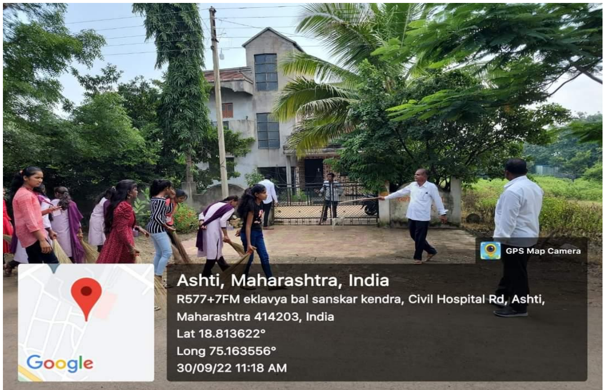
College students doing village cleaning at Murshadpur Ashti