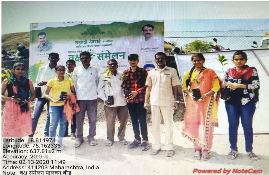
Teachers and students present at the Deorai Vriksha Sammelan(Tree planting campaign ) organized by the famous film actor Hon'ble Sayaji Shinde at Palawan Tal District Beed.