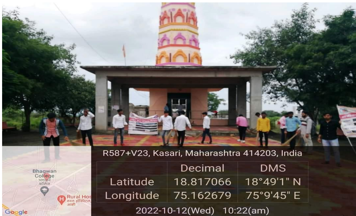
College students cleaning the temple premises of Lord Shankara in Dhanwade Vasti Ashti.