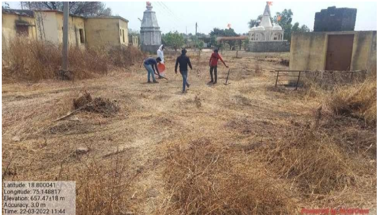
College students cleaning the temple premises of Lord Shankara in Dhanwade Vasti Ashti.